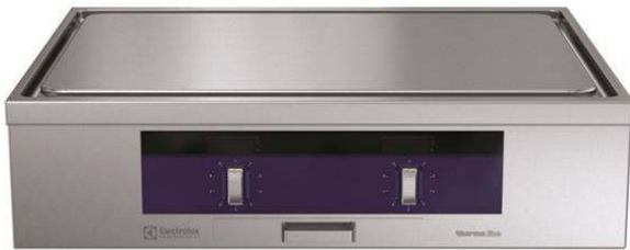
588011 (MALDACHOAO) Electric solid top, 4 zones, ecotop coating two-side operated